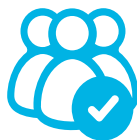
Improved student behavior